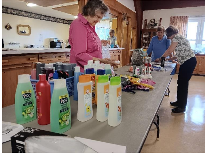
At left, parishioners at St. Mark's and St. Luke's enjoy a spring feast at St. Luke's. Above, Circle V is joined by St. Luke women for a lunch meeting and to pack personal bags.