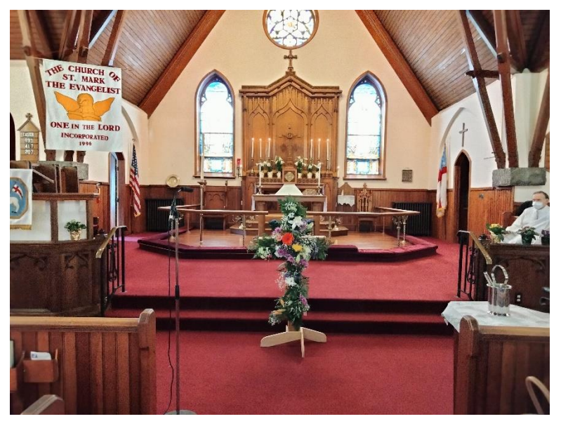
Easter Altar and Flowered Cross