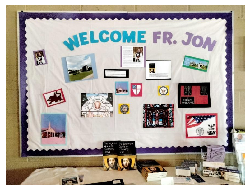
Parishioners welcome its new Priest-in-Charge