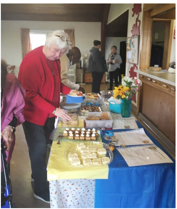
Special Ukraine Sunday Coffee Hour