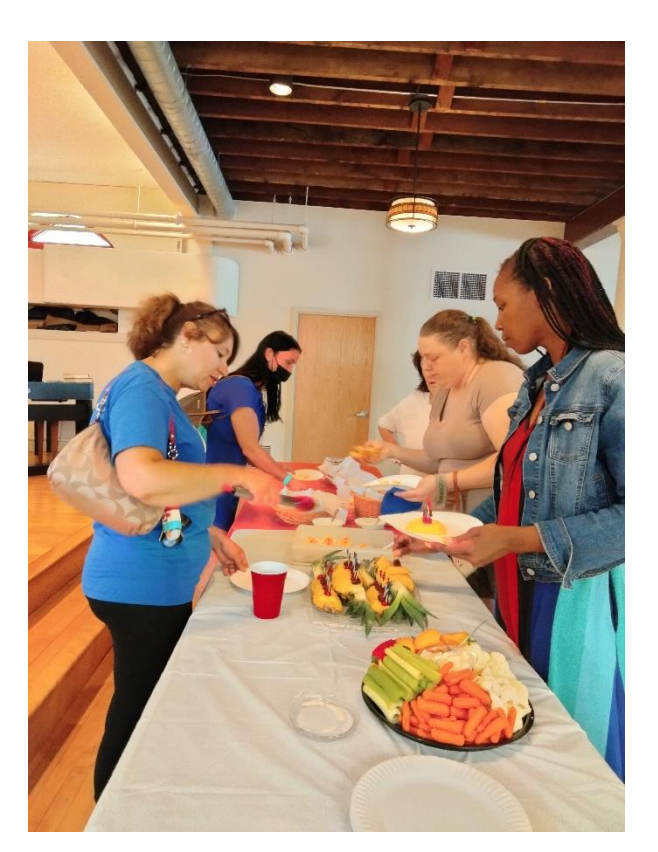
Meet and Greet with teachers at Porter Elementary School