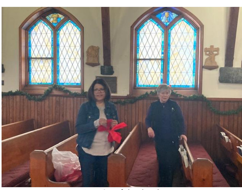
Greening of the church