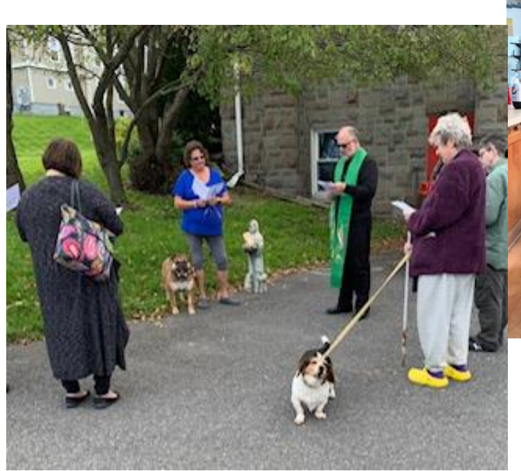
The Blessing of the Animals