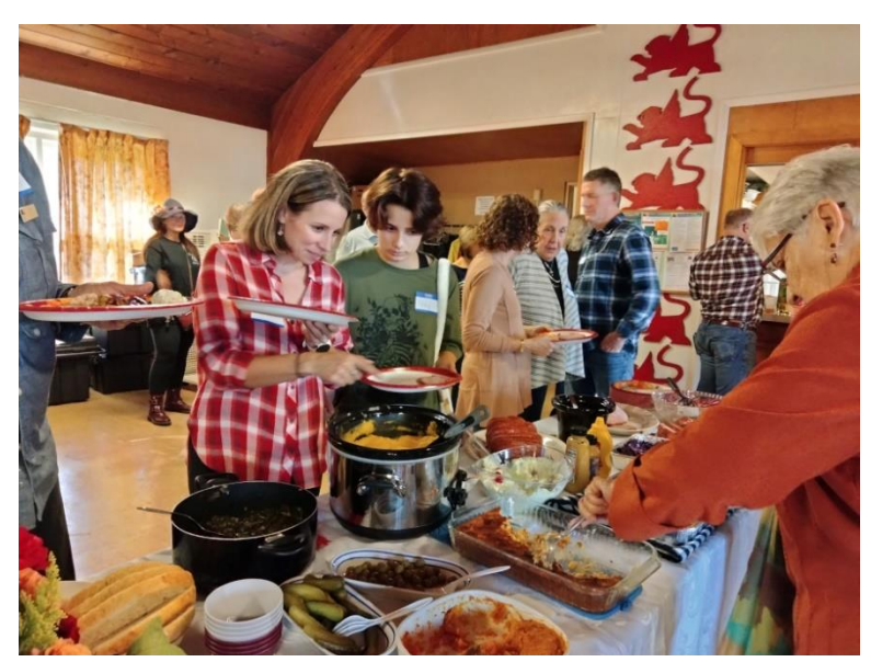
Lots of yummy food and fun at the joint fall dinner with St. Luke.