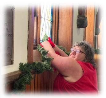
Scenes from the Greening of St Mark pg. 7