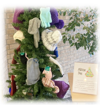
Library supports St. Mark Mission Pg. 6