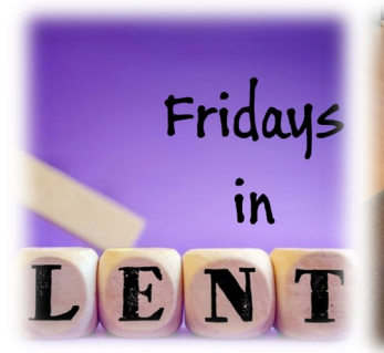
Fridays in Lent with St. Luke Pg. 2