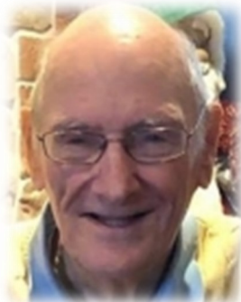
Forever in our Hearts...Pg. 8-13