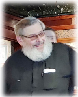
Celebrating 50 Years of Love and Service to God ...Pg. 4-5