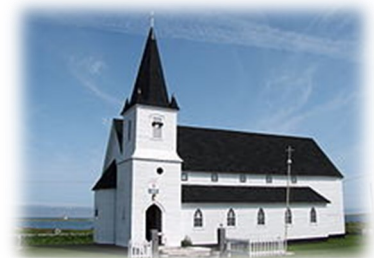
Saint Barnabas, Flowers Cove, Newfoundland