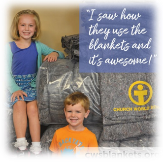
Nothing stops St. Mark from giving....not even a pandemic! Pg. 14