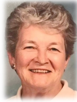
Forever in our Hearts...Pgs. 6-8