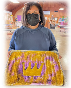
Special talent revealed ...Pg. 9