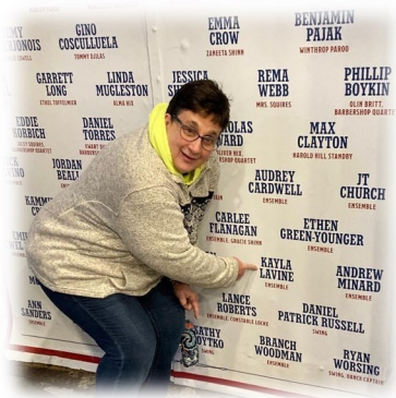
Broadway debut—proud grandparents...Pgs. 4-5