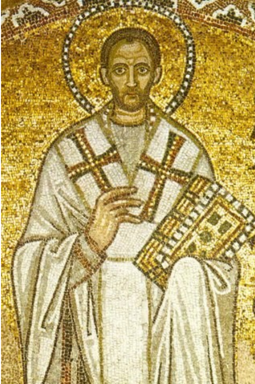
John Chrysostom (347AD-407AD)

A reading from a homily of John Chrysostom