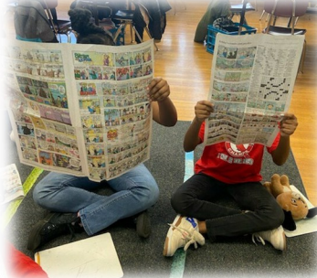
Special Ministry not to be laughed at! Pg. 6