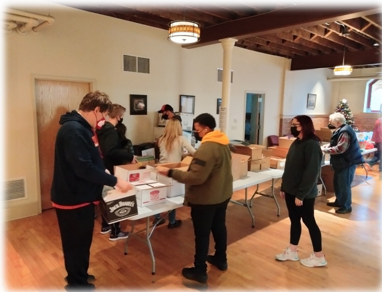
AccessCNY volunteers busy at work during a Food $en$e delivery.