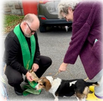
Blessing of the Pets held Pg. 5