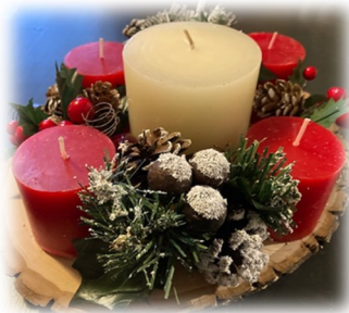
Advent 2022 Schedule of Events you won't want to miss! Pg. 5