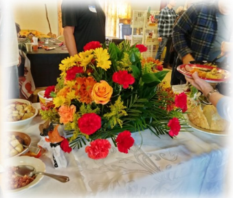
Joint Luncheon huge success ...and fun! pg. 7