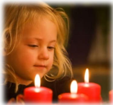
What Advent is All About.....Page 2