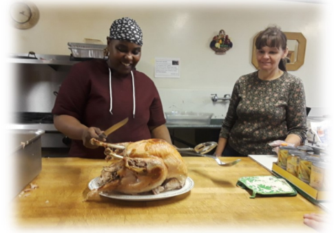
Evening Clothes Closet is a Big Hit .....Page 11