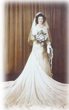
Forever in our Hearts.....page 4